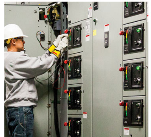
MOTOR CONTROL CENTERS & BUCKETS