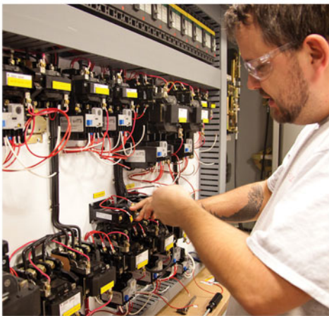
CUSTOM INDUSTRIAL CONTROL PANELS